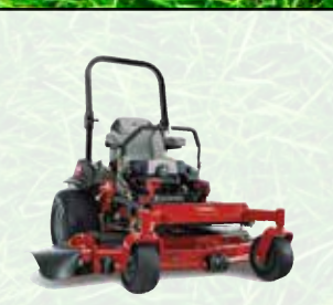
72910 Z Master® 5000

PAYMENTS AS LOW AS $332.48/Mo<sup>4</sup>