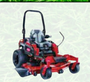
74054 Z Master® 4000