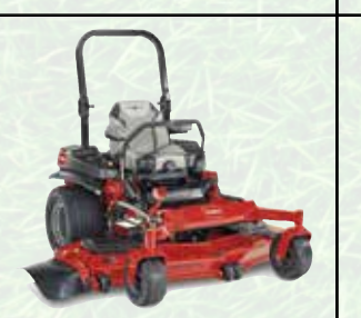
72960 Z Master® 6000

PAYMENTS AS LOW AS $231.85/Mo<sup>1</sup>