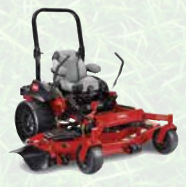
72911 Z Master® 5000